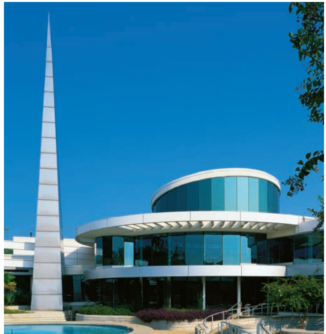
Hunter Henry Center at Mississippi State University, Mississippi State, MS Architect: Foil Wyatt Architects & Planners, P.A., Jackson, MS Glazing Contractor: American Glass Company, Inc., Columbus, MS

Solvent-free powder coatings add the "green" element with high performance, durability and scratch resistance that meet the standards of AAMA 2604.