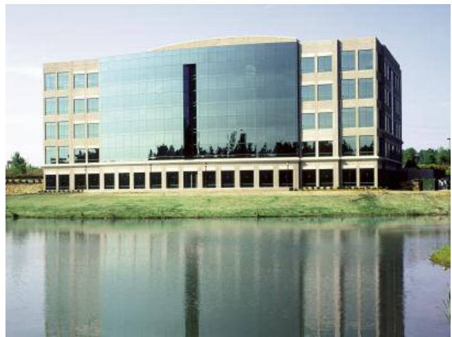
One Ballantyne, Ballantyne Corporate Park, Charlotte, NC Architect: TBA² Architects, Charlotte, NC Glazing Contractor: Cabarrus Glass Company, Inc., Concord, NC