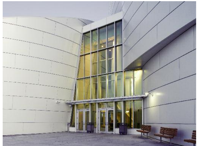
University of Alaska Museum of the North, Fairbanks, AK Architects: GDM Inc., Anchorage, AK; Hammel, Green and Abrahamson, Inc. (HGA), Minneapolis, MN Glazing Contractor: Commercial Contractors, Inc., Anchorage, AK