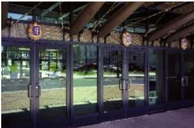
Comerica Park Stadium, Detroit, MI Architects: HOK Sport Facilities Group, Kansas City, MO; Smith, Hinchman and Grylls (SH&G), Detroit, MI; Rockwell Group, New York, NY Glazing Contractor: Universal Glass & Metals, Inc., Detroit, MI

Because a tough entrance needs to stand up to onslaughts of all kinds, 350 and 500 Tuffline® Entrances are available with panic hardware options, including Kawneer's Paneline® exit devices.