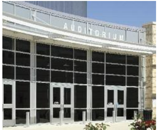
Fossil Ridge High School, Poudre School District, Ft. Collins, CO Architect: RB + B Architects, Inc., Ft. Collins, CO Glazing Contractor: B & W Glass, Inc., Cheyenne, WY

Solvent-free powder coatings add the "green" element with high performance, durability and scratch resistance that meet the standards of AAMA 2604.