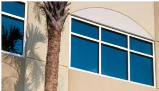
Tarpon Springs Public Safety Building, Tarpon Springs, FL Architect: Gee & Jenson, Engineers, Architects, Planners, Inc., West Palm Beach, FL Glazing Contractor: Ashe Glass & Mirror, Temple Terrace, FL