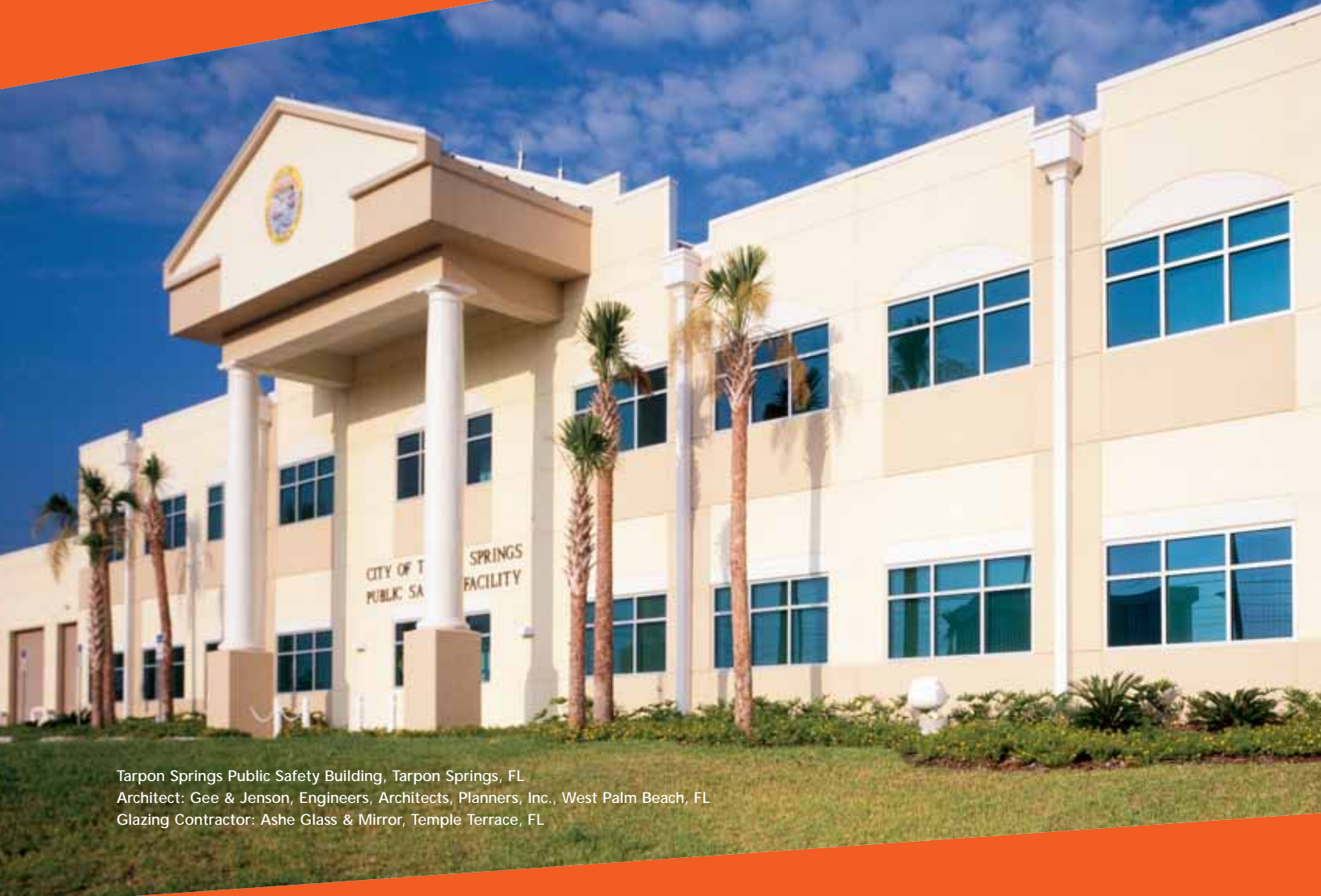
Tarpon Springs Public Safety Building, Tarpon Springs, FL Architect: Gee & Jenson, Engineers, Architects, Planners, Inc., West Palm Beach, FL Glazing Contractor: Ashe Glass & Mirror, Temple Terrace, FL

Single Source Hurricane Resistant Solutions and More