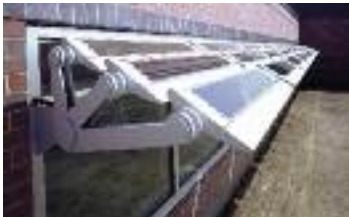
U.S. Environmental Protection Agency (EPA), New England Regional Laboratory, North Chelmsford, MA by Acquest Development, Buffalo, NY

A second non-articulating pivot point is located at the connection of the PV louver blade and the strut arm. This pivot point allows the PV cells to be optimally positioned to maximize the generation of electricity from the sun – 75 watts per bay at peak performance.