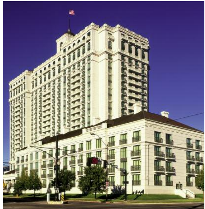
The Grand America Hotel, Salt Lake City, UT Architect: Smallwood, Reynolds & Associates, Inc., Atlanta, GA Glazing Contractor: Steel Encounters, Inc., Salt Lake City, UT

Solvent-free powder coatings add the “green” element with high performance, durability and scratch resistance that meet the standards of AAMA 2604.