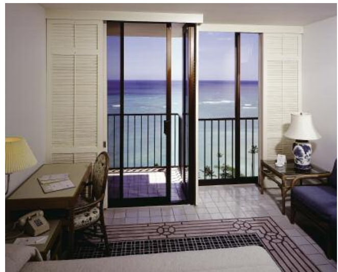
Waikiki Parc Hotel, Honolulu, HI Architect: Robert M. Matsushita & Associates, Honolulu, HI Glazing Contractor: HD&C Glass, Honolulu, HI

Note: Numbers in parentheses ( ) are millimeters unless otherwise noted.