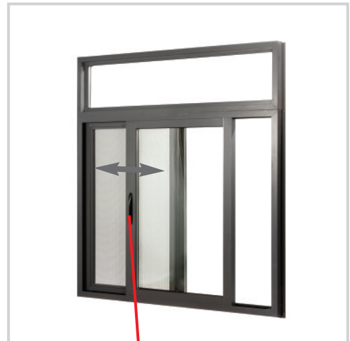
Patient has full control of the window for their own comfort