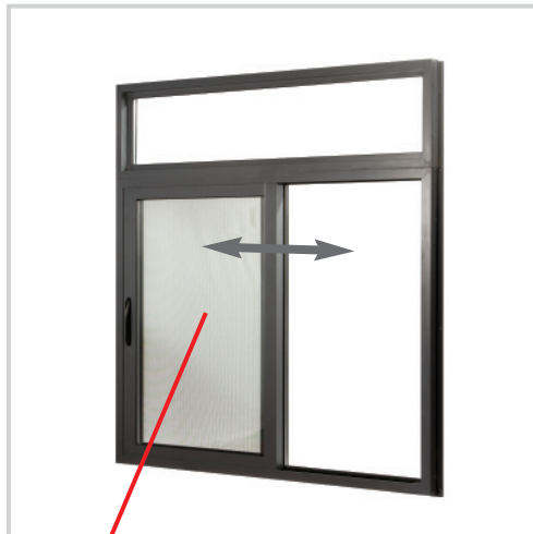
Permanent mesh on the outside of the window

The Specifier must ensure that the Security Level chosen is suitable for the occupants for present and future use.