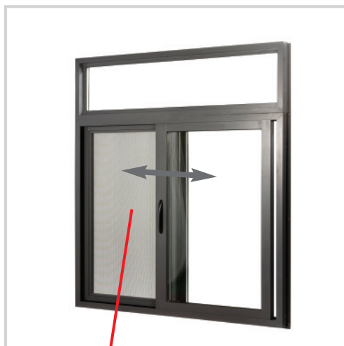
Vent opens to allow ventilation and security. Perforated stainless steel mesh stops the flow of contraband in or out of the window