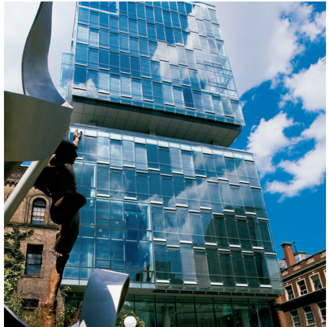
University of Toronto, Terrence Donnelly Centre for Cellular and Biomolecular Research, Toronto, Ontario, Canada Architects: architectsAlliance, Toronto, Ontario, Canada; and Behnisch Architekten, Stuttgart, Germany and Los Angeles, CA Glazing Contractor: Ferguson-Neudorf Glass, Inc., Beamsville, Ontario, Canada

Solvent-free powder coatings add the green element with high performance, durability and scratch resistance that meet the standards of AAMA 2604.